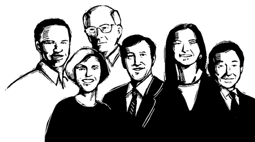
BOARD of DEACONS

It is amazing to me the number of people who don't have wills and who put their loved ones through misery after they die. Once again after a series of these mishaps four or five years ago it has happened again. Not that long ago a well meaning grandmother of two died without a will. Her house sits vacant, her finances in limbo, while the probate process groans on. There is a very good chance the house will be lost at a tax sale before the family can straighten out her estate. Her children are heart sick but their is little they can do with investing a significant amount of their own money, money the final estate settlement may not completely cover. If you care about your family, if you care about where your estate will go after you die, then get a will today.